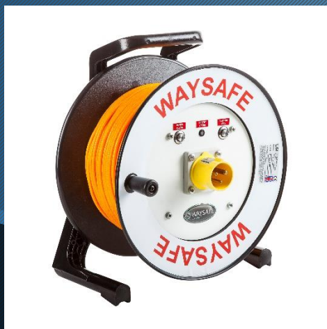
100m 110V Battery Backup Waysafe

The Waysafe linear illuminated marking system has been designed for use in low light or dark applications either internally or externally. It enables the user to mark a safe route or to mark a hazard.